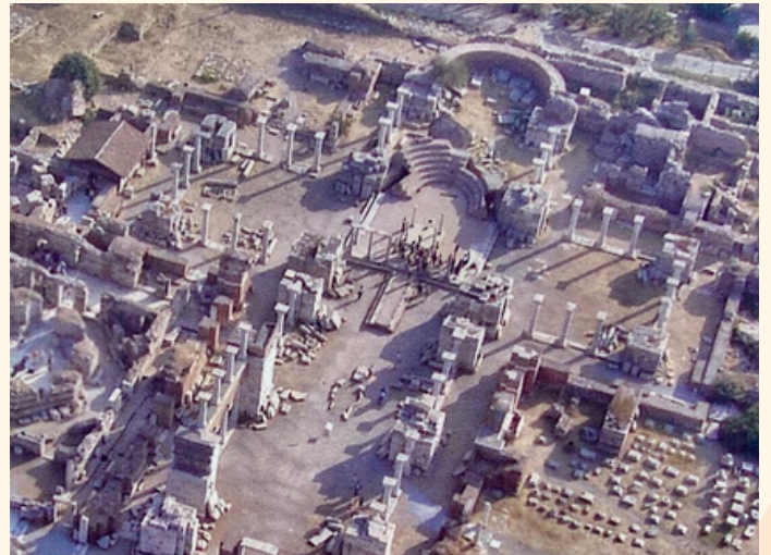
ST. JOHN'S CHURCH