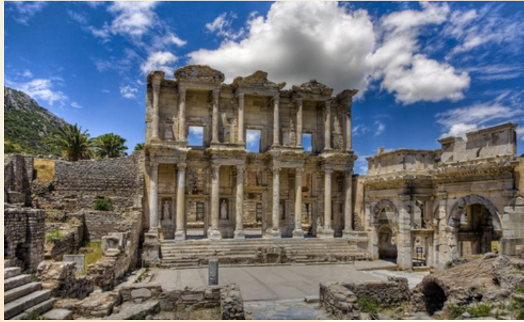
EPHESUS ANCIENT CITY