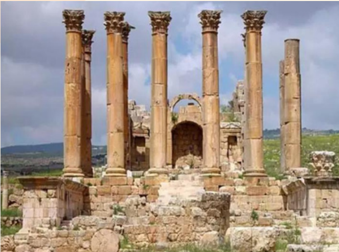
TEMPLE OF ARTEMIS