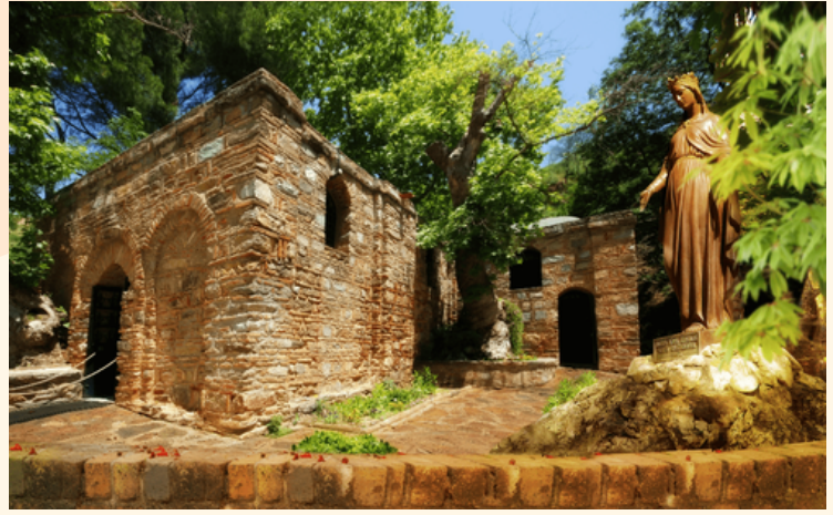
HOUSE OF VIRGIN MARY