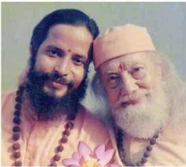
PARAMAHAMSA HARIHARANANDA (1907-2002) - (photo on the right)

Kriya Yoga is an ancient method of living and meditation that cultivates body, mind, intellect, and awareness of the soul using powerful meditative and yogic disciplines. It helps us to experience the three divine qualities of light, vibration, and sound by using techniques of concentration, posture, and breathing. This develops a one-pointed mind, which enables us to penetrate the deepest levels of consciousness and to change our lives. Kriya Yoga teaches that any action, kri , is done by ya , the indwelling soul. It is a universal spiritual discipline that crosses all divisions and boundaries.