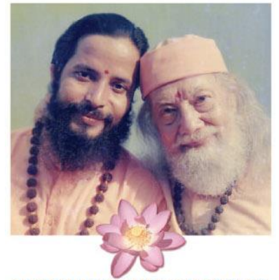
PARAMAHAMSA HARIHARANANDA (1907-2002) - (photo on the right)

Kriya Yoga is an ancient method of living and meditation that cultivates body, mind, intellect, and awareness of the soul using powerful meditative and yogic disciplines. It helps us to experience the three divine qualities of light, vibration, and sound by using techniques of concentration, posture, and breathing. This develops a one-pointed mind, which enables us to penetrate the deepest levels of consciousness and to change our lives. Kriya Yoga teaches that any action, kri , is done by ya , the indwelling soul. It is a universal spiritual discipline that crosses all divisions and boundaries.