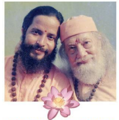
PARAMAHAMSA HARIHARANANDA (1907-2002) - (photo on the right)

Kriya Yoga is an ancient method of living and meditation that cultivates body, mind, intellect, and awareness of the soul using powerful meditative and yogic disciplines. It helps us to experience the three divine qualities of light, vibration, and sound by using techniques of concentration, posture, and breathing. This develops a one-pointed mind, which enables us to penetrate the deepest levels of consciousness and to change our lives. Kriya Yoga teaches that any action, kri , is done by ya , the indwelling soul. It is a universal spiritual discipline that crosses all divisions and boundaries.