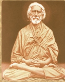
SWAMI SHRIYUKTESHWAR GIRI