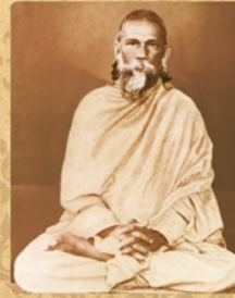
SWAMI SATYANANDA GIRI