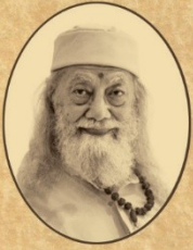
PARAMAHAMSA HARIHARANANDA (1907-2002)

Paramahansa Hariharananda is a beautiful example of purity and love. He comes from a long unbroken lineage of Masters, reaching the summit of Nirvikalpa Samadhi – the state of highest bliss without pulse or breath. A disciple of Swami Shriyukteshwarji and Paramahansa Yoganandaji, a highly realized Yogi, he spread Kriya Yoga in India and throughout the world.