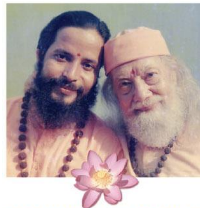
PARAMAHAMSA HARIHARANANDA (1907-2002) - (photo on the right)

Kriya Yoga is an ancient method of living and meditation that cultivates body, mind, intellect, and awareness of the soul using powerful meditative and yogic disciplines. It helps us to experience the three divine qualities of light, vibration, and sound by using techniques of concentration, posture, and breathing. This develops a one-pointed mind, which enables us to penetrate the deepest levels of consciousness and to change our lives. Kriya Yoga teaches that any action, kri , is done by ya , the indwelling soul. It is a universal spiritual discipline that crosses all divisions and boundaries.